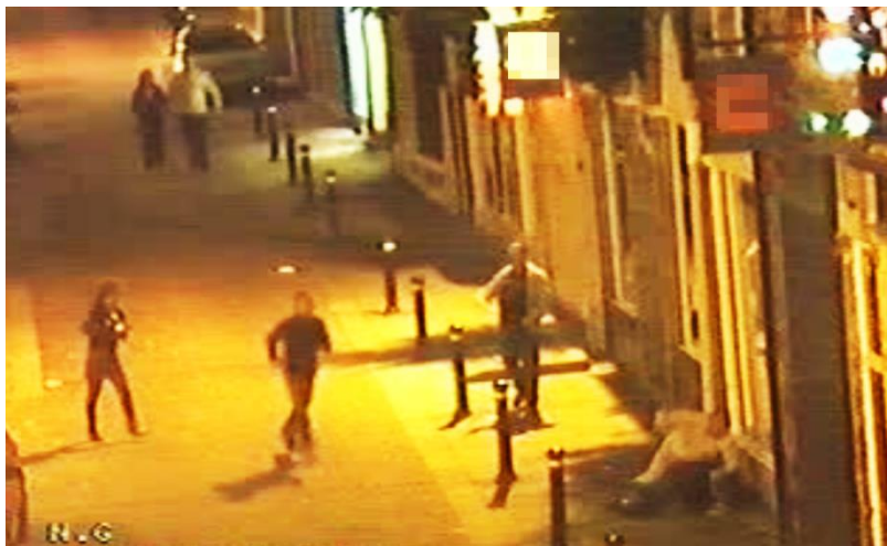
Figure 1b. To the bottom left-hand side, two bystanders leave their standing positions and approach the conflict parties.